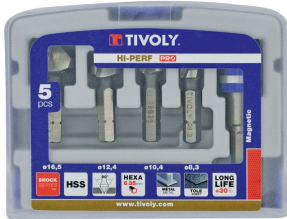
Countersinking bits Ø 8.3 - 10.4 - 12.4 - 16.5 mm + 1 bit-holder HALF TIVOLY BOX case

Fast and strong countersinking bit for steels. Suitable for Shock Series screwdrivers and machines 6.35 hexagonal shank.