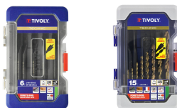
6 flat wood bits Ø 14 to 24 mm 15 pieces - 9 HSS speed point wood drill bits Ø 2 to 10 mm + 6 flat wood drill bits Ø 14 to 24 mm