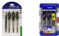
4 pieces - 3 wood drill bits with 4 cutting edges, cutting edges Ø 20 to 25 mm + 1 extension 6 wood drill bits with 4 cutting edges, hexagonal shank Ø 12 to 32 mm