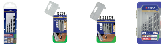
5x SLR graduated 3-point wood drill bits Ø 2 to 5 mm 6x SLR graduated 3-point wood drill bits Ø 2 to 8 mm 8x SLR graduated 3-point wood drill bits Ø 2 to 10 mm 9x SLR graduated 3-point wood drill bits Ø 2 to 12 mm