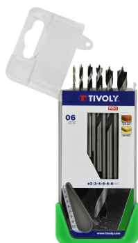
Ø2- 3- 4- 5- 6- 8 mm - CLIPSTER Case

Drill bit suitable for all types of wood thanks to its 3-point sharpening and its rectified flutes.