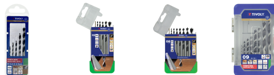
5x SLR graduated 3-point wood drill bits Ø 2 to 5 mm 6x SLR graduated 3-point wood drill bits Ø 2 to 8 mm 8x SLR graduated 3-point wood drill bits Ø 2 to 10 mm 9x SLR graduated 3-point wood drill bits Ø 2 to 12 mm