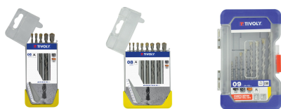
5 concrete drill bits Ø 4 to 10 mm 8 concrete drill bits Ø 3 to 10 mm 9 concrete drill bits Ø 3 to 12 mm