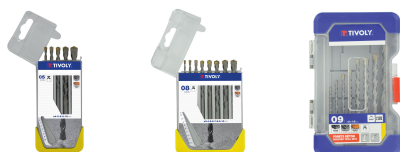
5 concrete drill bits Ø 4 to 10 mm 8 concrete drill bits Ø 3 to 10 mm 9 concrete drill bits Ø 3 to 12 mm