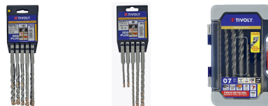
10 MASTER3 SDS+ drill bits with 3 cutting edges L 110-160 mm Ø 6 to 14 mm 5 MASTER3 SDS+ drill bits with 3 cutting edges L 110-160 mm Ø 5 to 10 mm 7 MASTER3 SDS+ drill bits with 3 cutting edges L 110-160 mm Ø 5 to 12 mm