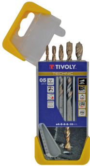
Ø 4- 5- 6- 8- 10mm - CLIPSTER Case

High-performance drill bit for the incredibly fast and precise drilling of reinforced concrete and hard materials, thanks to its faceted carbide cutting insert.