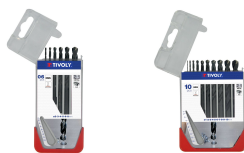
6 fully ground HSS STEAM metal drill bits, Split point, Ø 2 to 8 mm 10 fully ground HSS STEAM metal drill bits, Split point, Ø 1 to 10 mm