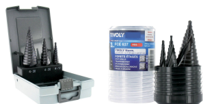
3 TiAlN coated HSS step drill bits Ø 4 to 30 mm