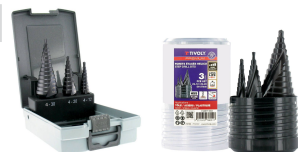
3 TiAlN coated HSS step drill bits Ø 4 to 30 mm 3 TiAlN coated HSS step drill bits Ø 4 to 37 mm