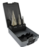
3 conical stepped HSS drill bits with helical flutes Ø 4 to 30 mm