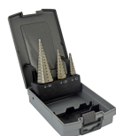
3 conical HSS step drill bits with straight flutes Ø 4 to 30 mm