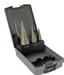
3 conical HSS step drill bits with straight flutes Ø 4 to 30 mm