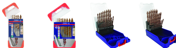
6 HSS metal drill bit coated FUSIO Grinding Tivoly Smart Point Ø1 to 8mm 10 HSS metal drill bit Coated FUSIO Grinding Tivoly Smart Point Ø 1 to 10mm 19 HSS metal drill bit Coated FUSIO Grinding Tivoly Smart Point Ø 1 to 10mm 25 HSS metal drill bit coated FUSIO Grinding Tivoly Smart Point Ø 1 to 13 mm