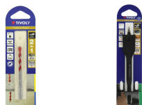
2 in 1 concrete/tile drill bit - Ground carbide cutting insert - Ribbed fluting TECHNIC (Blister) Flat wood bit - Hexagonal shank - Reinforced body TECHNIC (Blister)