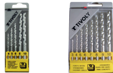
5 concrete drill bits Ø 4 to 10 mm 8 concrete drill bits Ø 3 to 10 mm