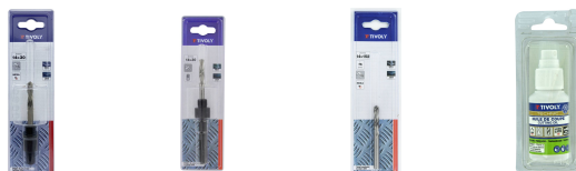
Bi-metal pilot shaft - Hexagonal shank ESSENTIAL (Blister)