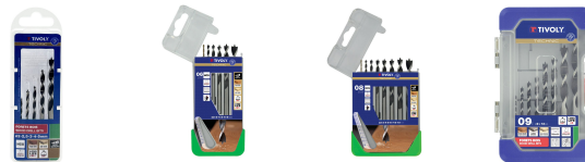
5x SLR graduated 3-point wood drill bits Ø 2 to 5 mm 6x SLR graduated 3-point wood drill bits Ø 2 to 8 mm 8x SLR graduated 3-point wood drill bits Ø 2 to 10 mm 9x SLR graduated 3-point wood drill bits Ø 2 to 12 mm