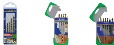
5 speed point wood drill bits Ø 2 to 5 mm 6 speed point wood drill bits Ø 2 to 8 mm 8 speed point wood drill bits Ø 2 to 10 mm