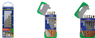
5 speed point wood drill bits Ø 2 to 5 mm 6 speed point wood drill bits Ø 2 to 8 mm 8 speed point wood drill bits Ø 2 to 10 mm