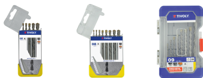
5 concrete drill bits Ø 4 to 10 mm 8 concrete drill bits Ø 3 to 10 mm 9 concrete drill bits Ø 3 to 12 mm