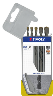
Ø 4- 5- 6- 8- 10mm - CLIPSTER Case

High-strength drill bit for drilling concretes and construction materials.