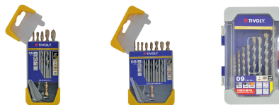
5 SLR graduated concrete drill bits Ø 4 to 10 mm