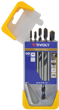
Ø 4- 5- 6- 8- 10mm - CLIPSTER Case

High-performance drill bit, fast and strong, for vibrated concrete and stone, thanks to its ground carbide cutting insert with a diamond burr.