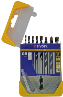
Ø 3- 4- 5- 6- 7- 8- 9- 10mm - CLIPSTER Case

High-performance drill bit, fast and strong, for vibrated concrete and stone, thanks to its ground carbide cutting insert with a diamond burr.