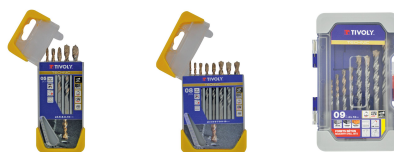
5 SLR graduated concrete drill bits Ø 4 to 10 mm