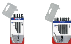
6 fully ground HSS STEAM metal drill bits, Split point, Ø 2 to 8 mm 10 fully ground HSS STEAM metal drill bits, Split point, Ø 1 to 10 mm