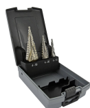
3 conical stepped HSS drill bits with helical flutes Ø 4 to 30 mm