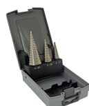
3 conical HSS step drill bits with straight flutes Ø 4 to 30 mm