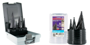
3 TiAlN coated HSS -E5 (Cobalt 5%) step drill bits Ø 4 to 30 mm 3 TiAlN coated HSS -E5 (Cobalt 5%) step drill bits Ø 4 to 37 mm