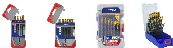
6 fully ground TiN coated HSS metal drill bits, split point - Tri-flat shank Ø 2 to 8 mm 10 fully ground TiN coated HSS metal drill bits, split point - Tri-flat shank Ø 1 to 10 mm 18 fully ground TiN coated HSS metal drill bits, split point - Tri-flat shank Ø 2 to 10 mm 25 fully ground TiN coated HSS metal drill bits, split point - Tri-flat shank Ø 1 to 13 mm