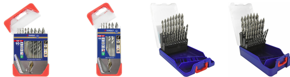
10 HSS metal drill bit Grinding Tivoly Smart Point Ø 1 to 10mm 6 HSS metal drill bit Grinding Tivoly Smart Point Ø 1 to 8mm 19 HSS metal drill bit Grinding Tivoly Smart Point Ø 1 to 10mm 25 HSS metal drill bit Grinding Tivoly Smart Point Ø 1 to 13mm