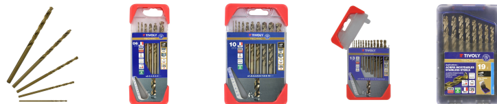
19 HSS-E5 (5% cobalt) metal drill bits - SLR graduated - Split point - Ø 1 to 13 mm 6 HSS-E5 (5% cobalt) metal drill bits - SLR graduated - Split point - Ø 1 to 8 mm 10 HSS-E5 metal drill bit (5% cobalt) - SLR graduated - Ø 1 to 10 mm 13 HSS-E5 (5% cobalt) metal drill bits - SLR graduated - Split point - Ø 1.5 to 6.5 mm 19 HSS-E5 metal drill bit (5% cobalt) - SLR graduated - Split point - Ø 1 to 10 mm