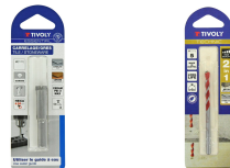
Wet core diamond drill bit - Hexagonal shank ESSENTIAL (Blister) 2 in 1 concrete/tile drill bit - Ground carbide cutting insert - Ribbed fluting TECHNIC (Blister)