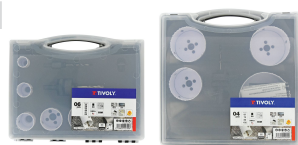
9-piece case - 6 HSS bi-metal hole saws Ø 22 to 68 mm + 2 pilot shafts + 1 adapter