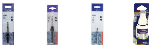
Bi-metal pilot shaft - Hexagonal shank ESSENTIAL (Blister) Bi-metal pilot shaft - SDS+ shank ESSENTIAL (Blister) Pilot drill bits ESSENTIAL (Blister) 70% biodegradable cutting oil TECHNIC (Blister Box)